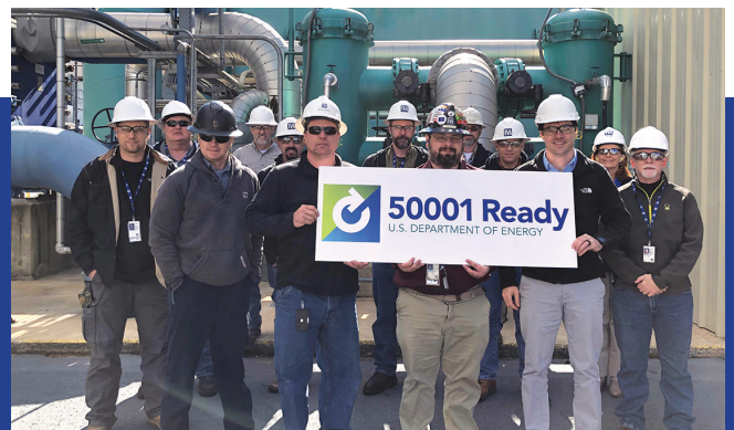
TVA Magnolia Energy Team Members.